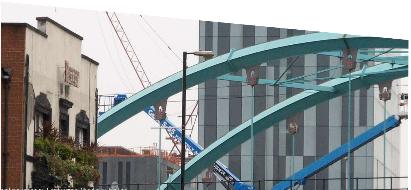
matleena mihonen | City Layers in Manchester, England

18.00 – City of Espoo providing guided tour in Espoo; Kauklahti housing fair area