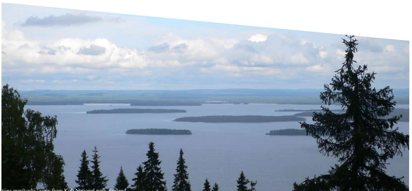
tiina.merikoski | view from Koli National park, Finland